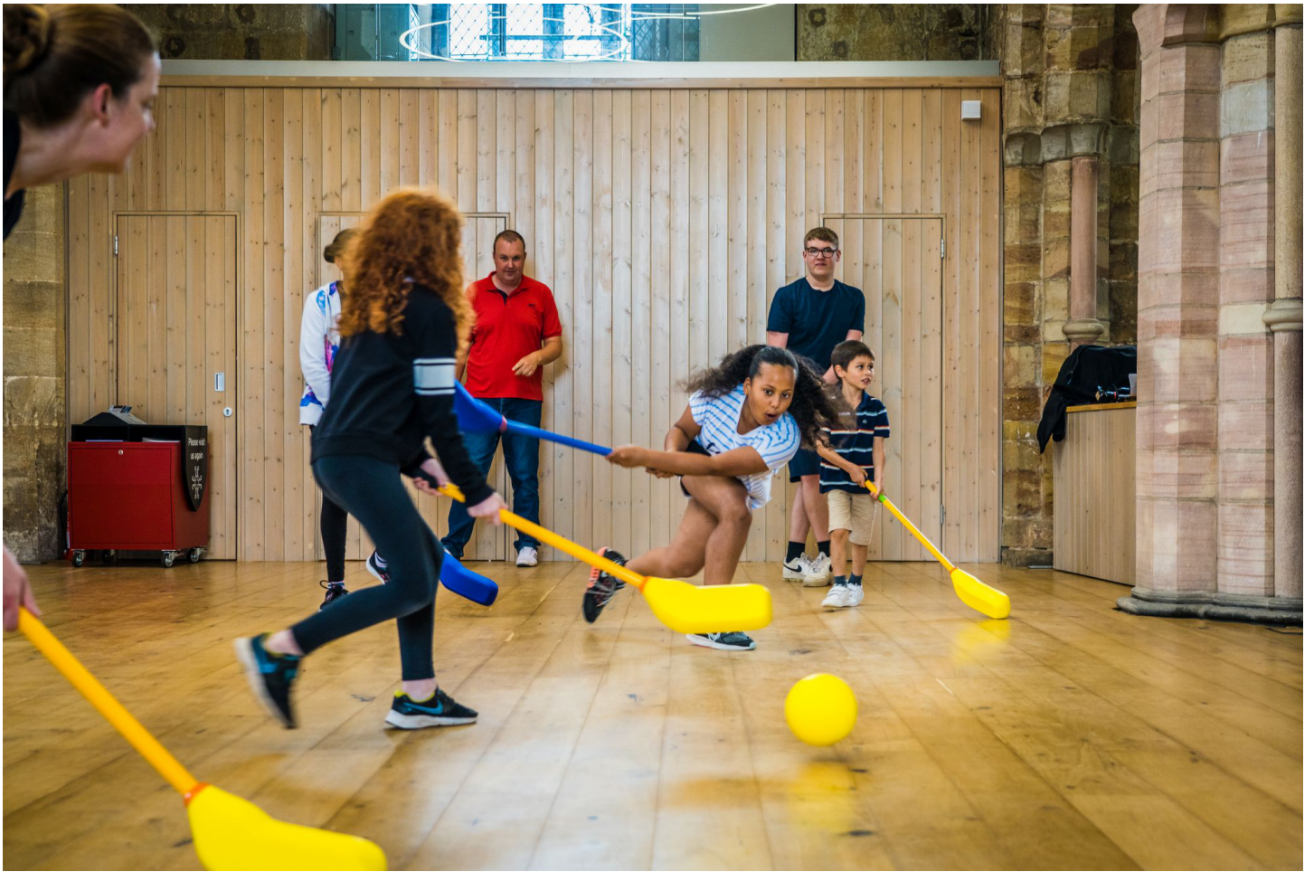
Soft Hockey Club