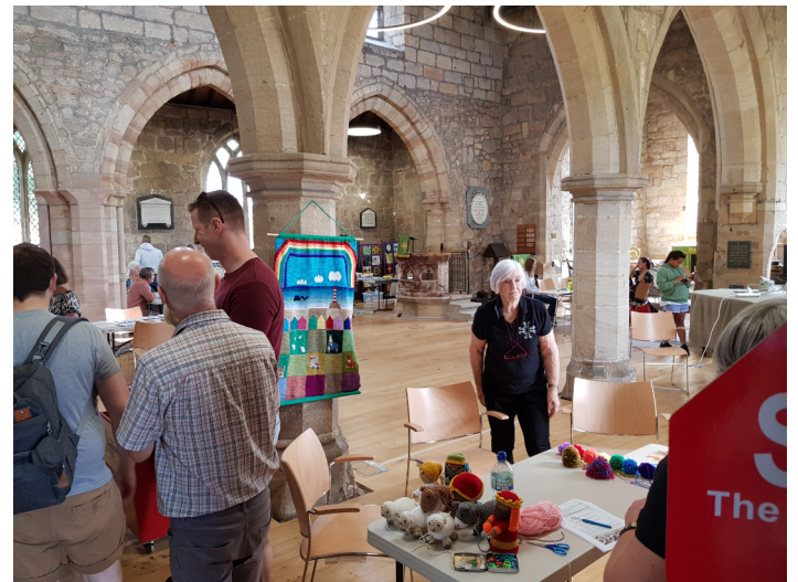
Open Day September

In addition to the above, please keep a look out for extra activities, and posters about the events.